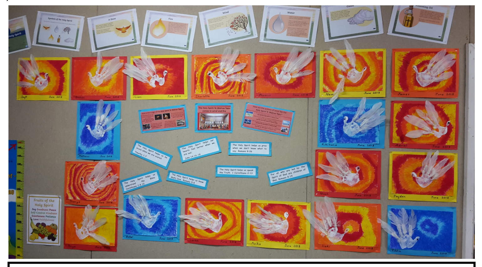
Check out Room 4's Holy Spirit Art displayed in our school corridor. Thank you Room 4 for sharing your learning with us.